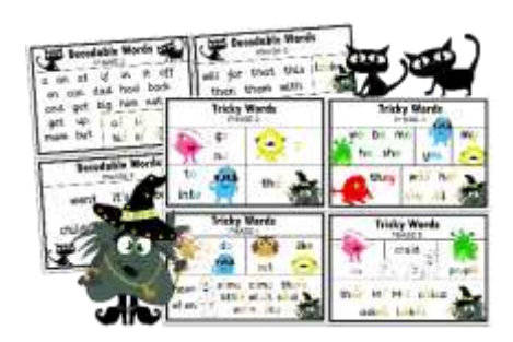
Tricky and Decodable Letters & Sounds Cards