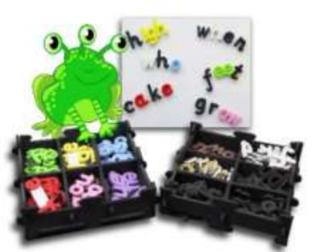
Magnetic Letter Kits