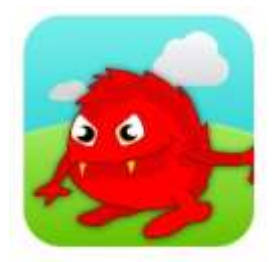
Monster Phonics Learn to Spell the First 100 High-Frequency Words