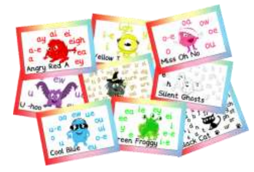
Set of 10 A4 Sounds Posters