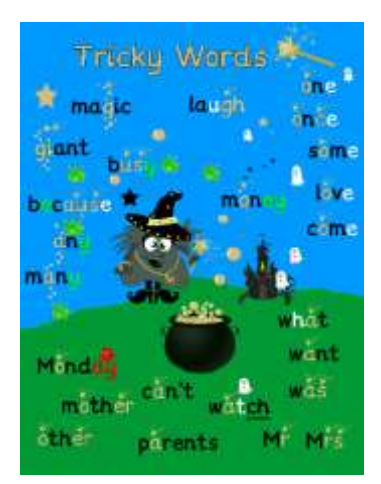
Tricky Words Poster