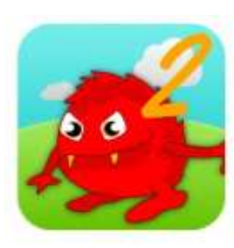
Monster Phonics Learn to Spell the Next 200 High-Frequency Words