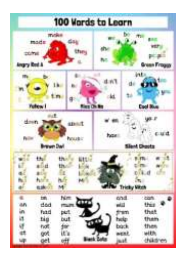
High-Frequency Words Poster